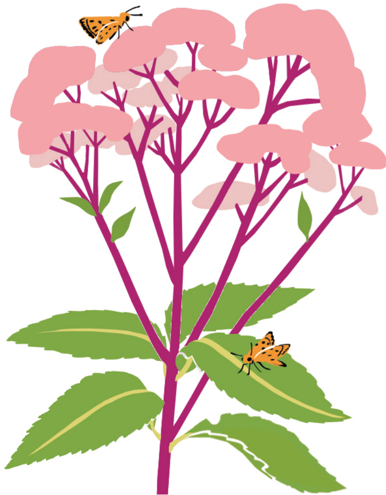
Joe Pye Weed attracts many butterflies and pollinators.

Nectar is the sugary fluid made by flowers to attract pollinators. In addition to sugar and water, nectar provides butterflies with nutrients such as amino acids, proteins, enzymes, and vitamins. Choose nectar plants with different bloom times so that when one plant species stops blooming another begins, and always choose species that are native to New Jersey! Also, butterflies generally feed only in the sun, so pick the sunniest spot in your garden to grow your nectar plants.